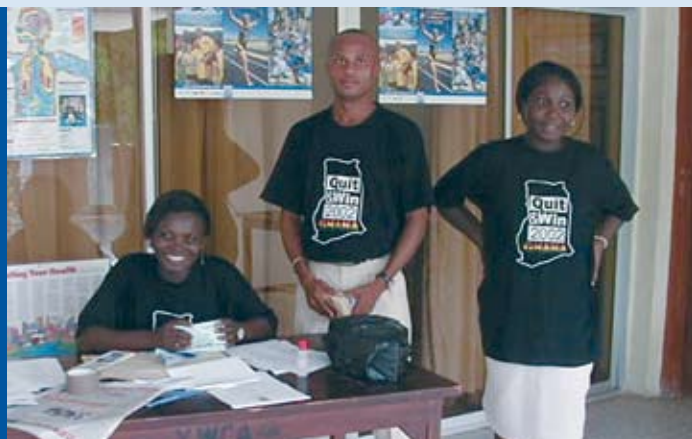
Quit and Win in Ghana 2002