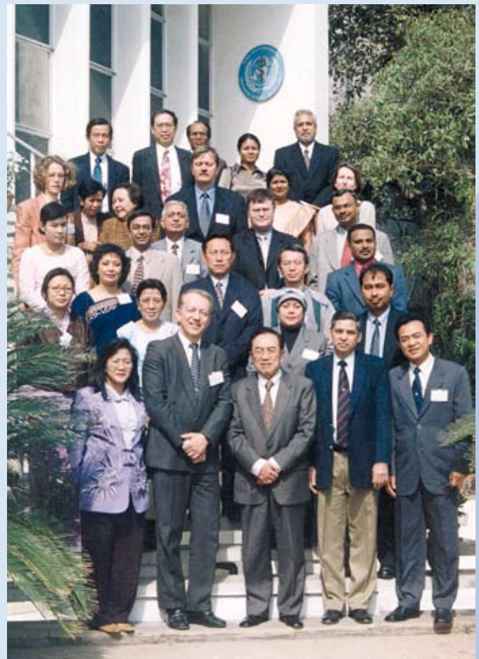
WHO Regional Consultation, New Delhi 2003