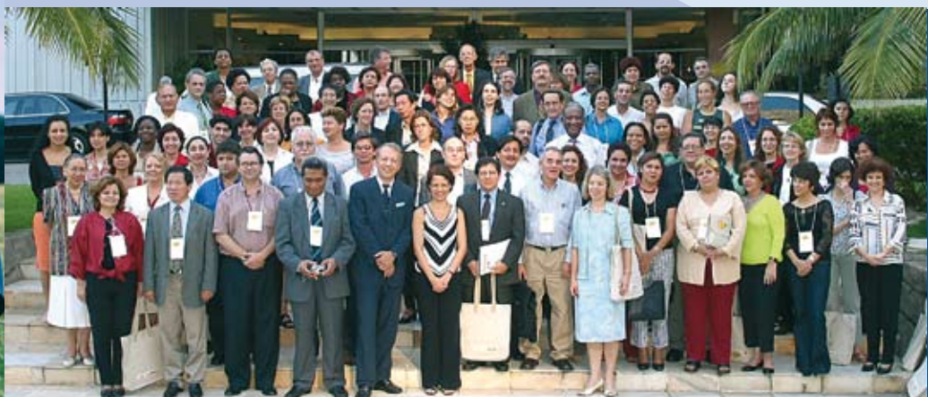
WHO Global Forum, Rio de Janeiro 2003