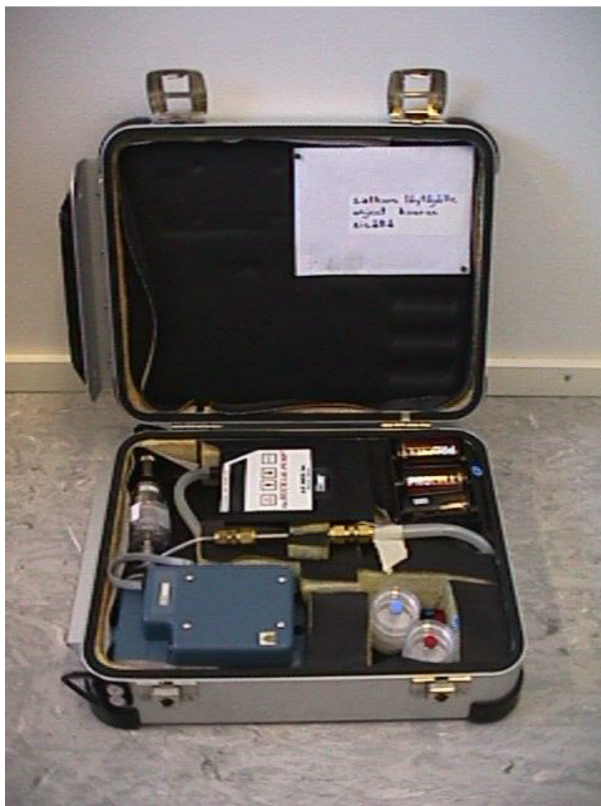
Figure 3. The personal exposure monitor (PEM) developed for the EXPOLIS study. Tenax TA VOC sampling line is in the middle of the case. PM 2.5 cyclone with a filter holder is in the back left corner, pump in the middle, and battery holder in the back right corner. CO monitor is in the front left corner.

Personal exposure and microenvironment concentration measurements were carried out by personal exposure (PEMs) and microenvironment monitors (MEMs), respectively. PEMs, carried by each participant for 48 hr, were packed into a sealed aluminum briefcase (Figure 3).