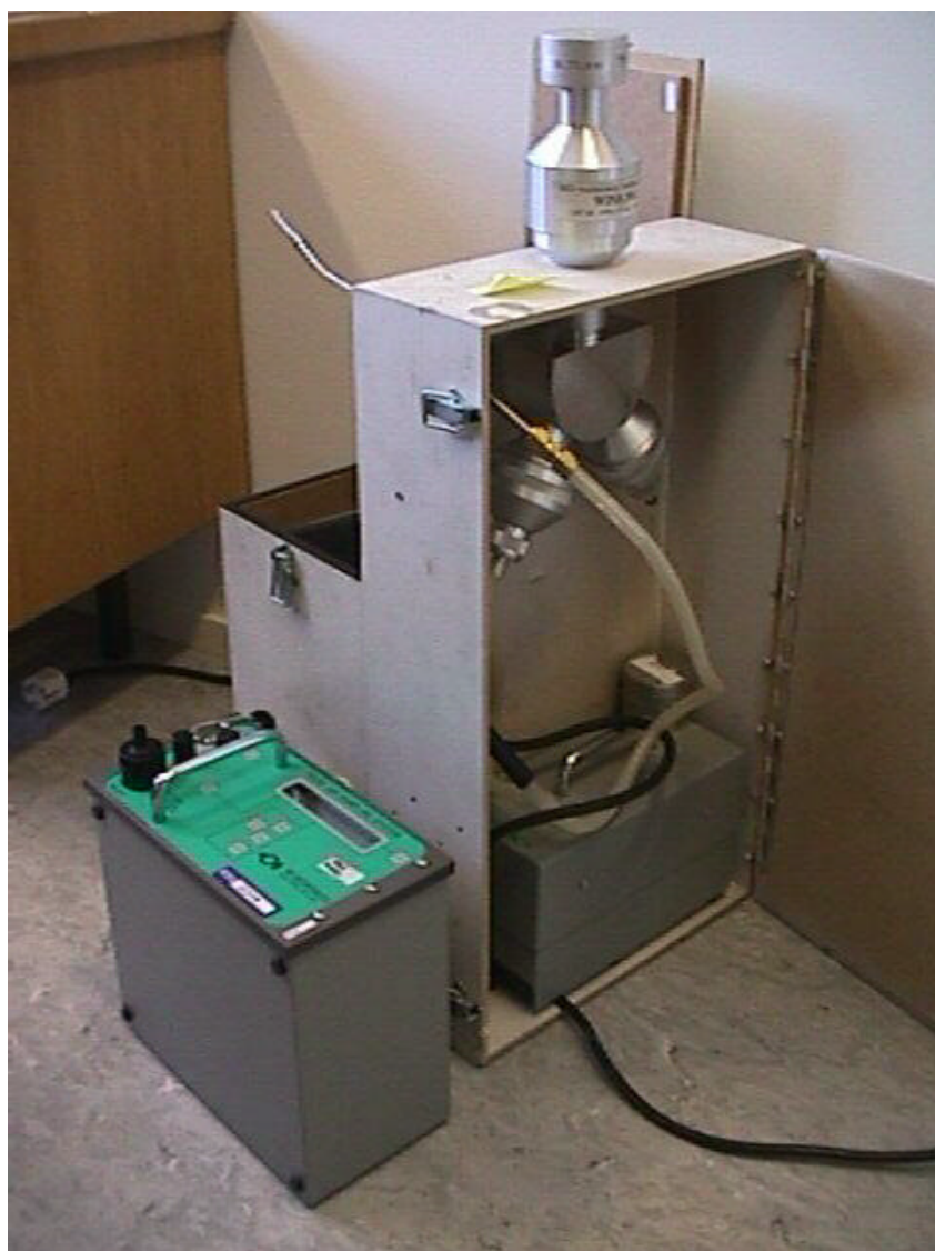
Figure 4. The microenvironment monitor (MEM) developed for the EXPOLIS study. Tenax TA VOC sampling tube is in the middle of the box. The PM_{2.5} impactor is above the box, two filter holders are inside the box, the charger is at the bottom, and the pump is outside the box. The pump was placed inside the lower part of the box connected to the tubing, and the doors were closed during runs.

MEMs were packed into sealed containers made of MDF board with low-emission paint (Figure 4). No significant emissions of VOCs were measured during testing of container material at VTT Chemical Technology (Espoo, Finland).